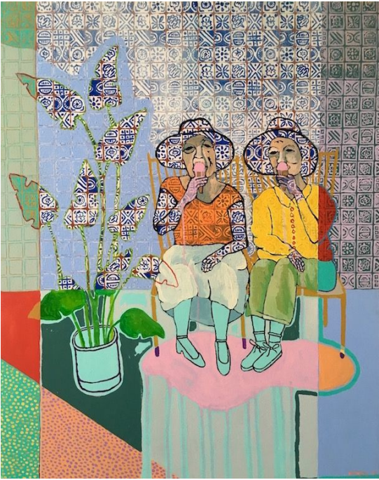
We've reached a time of stillness (and I'm happy) , Katrina Jurjens, exhibiting at Stadt Cafe